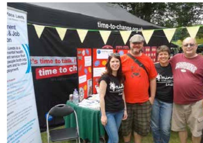
WorkPlace Leeds Team join Time to Change at Kirkstall Festival.