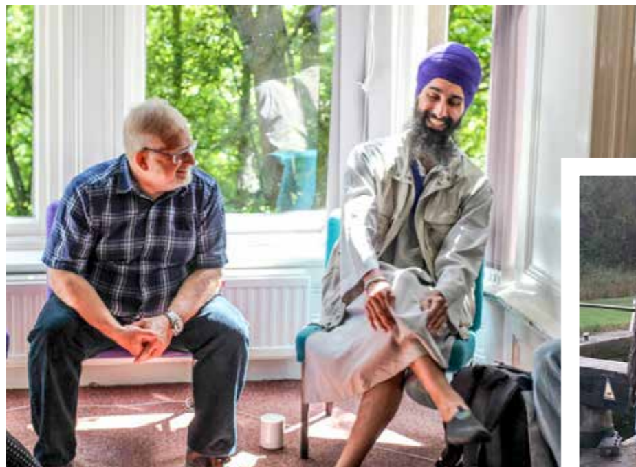
Top: Peer Support Group. Right: Walking group members.