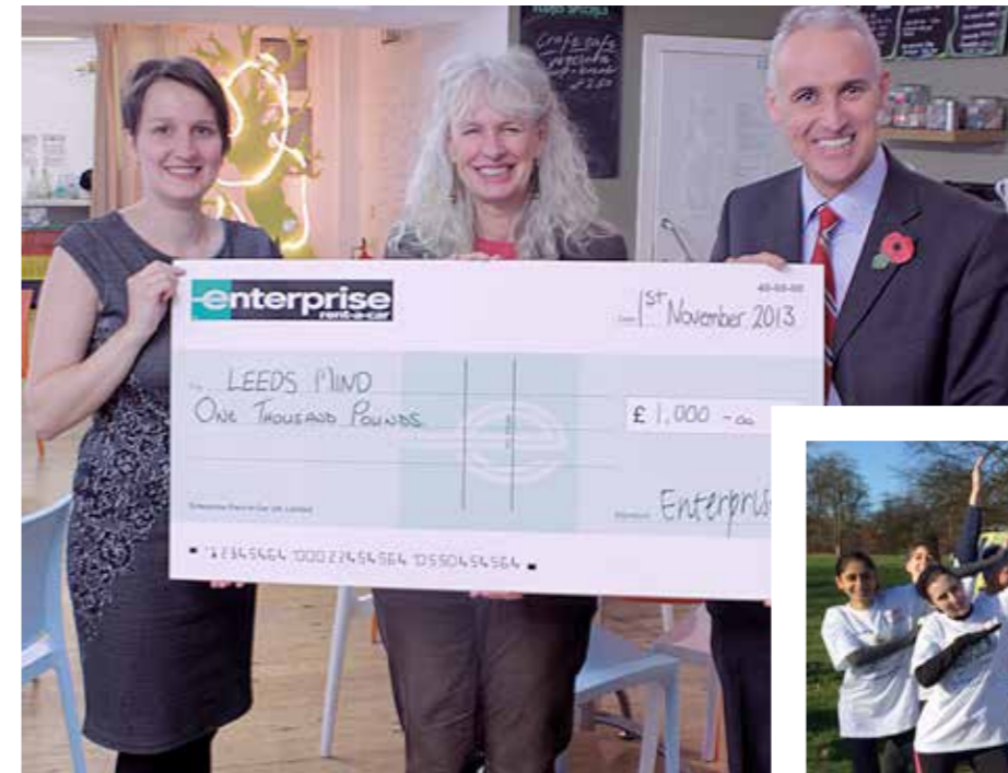
Enterprise rent-a-car donate an amazing £1000.