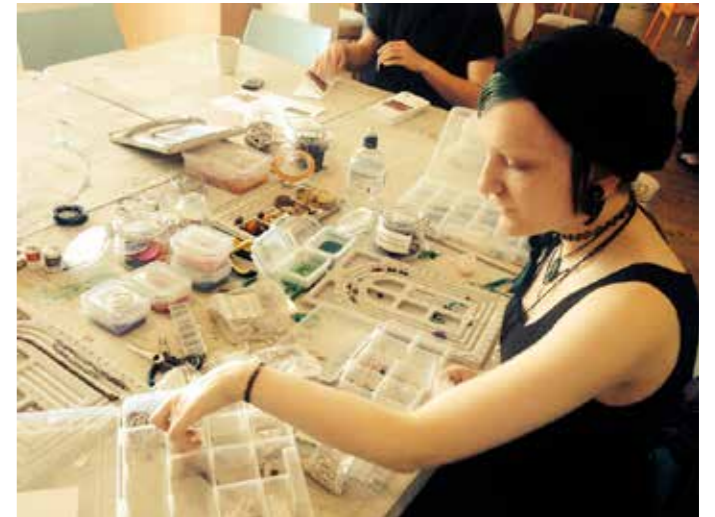
Jewellery making at Inkwell's Craft Cafe.