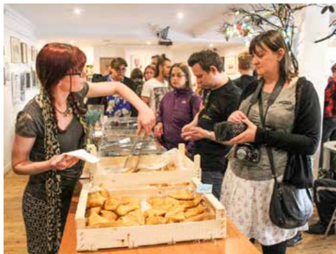
Inkwell Food Festival.

"I currently feel that I am engaged in purposeful and meaningful activities and can call myself an artist. This positive identity is reaffirming to myself and improved my self-image, but is also significant to my place in the wider community."