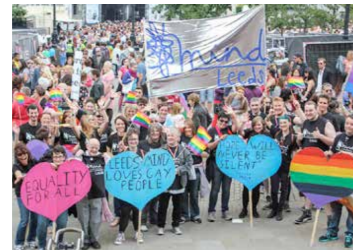
Leeds Mind at Leeds Pride.

All of these achievements are testimony to the ongoing commitment, passion and hard work of the staff team and volunteers in continuing to provide a high quality service to all our clients during a period of growth and transition for the service. It also demonstrates the resilience and hard work of our clients as they make their journeys to gaining and retaining work. A big thank you to all!