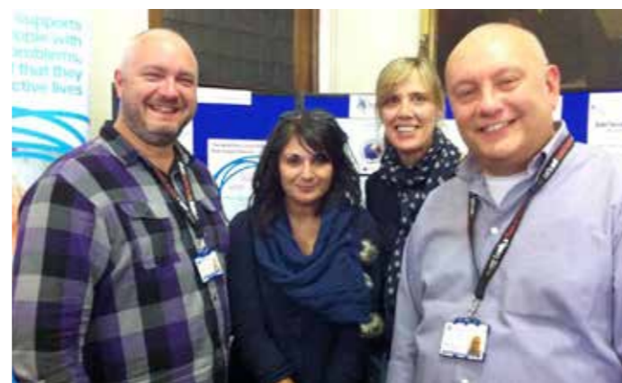
WorkPlace Leeds team at World Mental Health Day.

Our IT service has flourished over the past year, with demand remaining high and qualifications gained exceeding all targets. The service received an A rating from the British Computer Society. This is a particular testimony to our IT tutor and the volunteers who have been invaluable to us, and our clients.