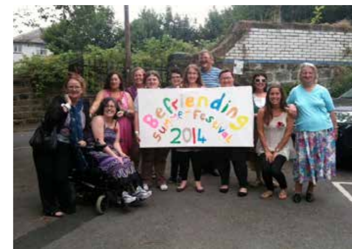
Befriending Social Group Summer Festival.

A recent evaluation of the service found that 86% of clients felt the service had helped to; alleviate loneliness, expand horizons and increased self-esteem.