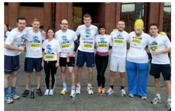
Top: Team Tight Butts take part in the Bramham Major Series. Middle: Team Leeds Mind take part in the Leeds 10k. Bottom: Leeds Digital Marketing Company “Stickyeeyes” taking part in the 2013 Abbey Dash.